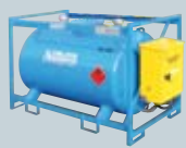
Traspo® approved IBC tanks for fuel transport from 250 to 910 litres capacity