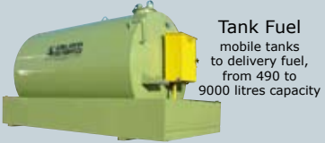
Tank Fuel mobile tanks to delivery fuel, from 490 to 9000 litres capacity