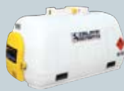
Hippotank® approved IBC polyethylene tanks for fuel transport 960 litres capacity