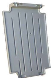
Lid for Carrytank@ 220

Polyethylene covering Lid, integrated in the tank's structure and manufactured in rotational molding.