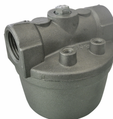
Strainer filter stainless steel

Retention basin for ground use, 100% tank's volume capacity, made in carbon steel.