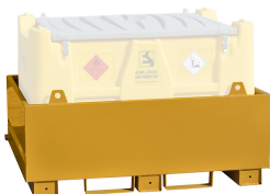
Retention Basin for Carrytank

Polyethylene covering Lid, integrated in the tank's structure and manufactured in rotational molding.