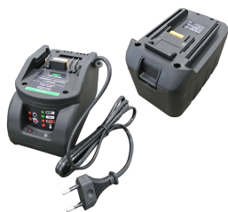
Manganese 12V battery with battery charger (European plug type C) and battery slot