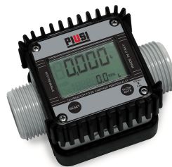
Digital flow meter for AdBlue K24