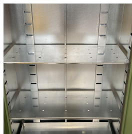
Galvanised adjustable steel shelves